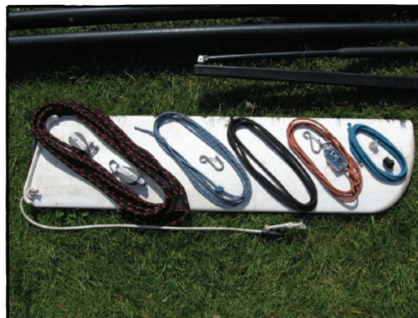
Photo 2, The ropes we need