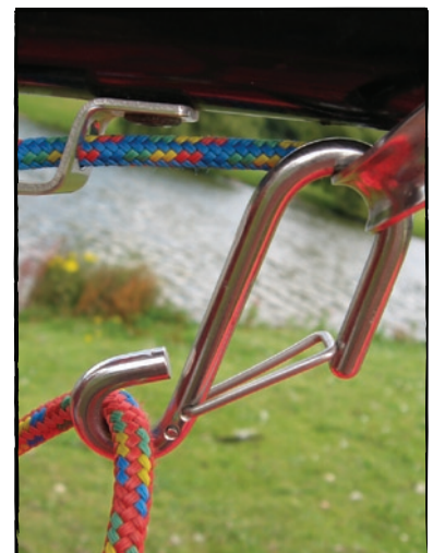
Photo 27, Around the hook