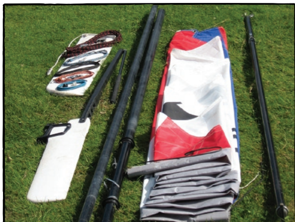
Photo 1, All the Parts

Mast (top and bottom sections), Boom, Main sail, Rudder, Tiller and Extension, Daggerboard, Outhaul (long length of rope), Cunningham (medium length of rope), Clew tie down hook, Mainsheet, Kicking strap, Painter rope, Horse (a rope for the rear rigging arrangements), Bung.