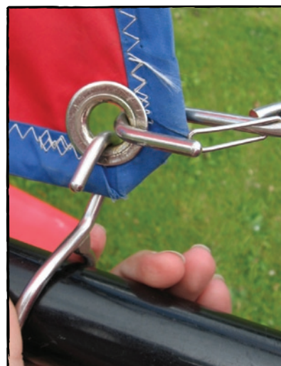
Photo 22, Clew and outhaul