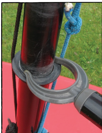
Photo 21, Adding the boom

Clip the boom onto its fitting on the mast, with the main sail halyard inside of the clip (we're showing it outside for the purpose of showing what not to do). Secure the clew of the sail onto the boom with the clew tie down (metal hook or piece of rope), and then clip the outhaul through the clew of the sail (Photo 22).