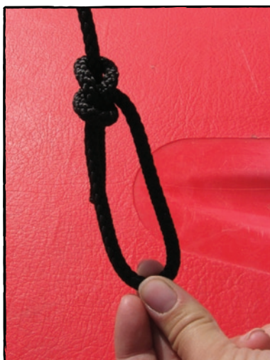
Photo 30, Make a bowline

Attach the horse; tie a bowline in the one end (Photo 30), feed the working end through the eyeholes (Picture 31) and then back through the bowline (Photo 32) forming a triangle (Photo 33), then the working end goes through the jam cleat inside the cockpit (Picture 35). Tie a stopper knot as necessary.