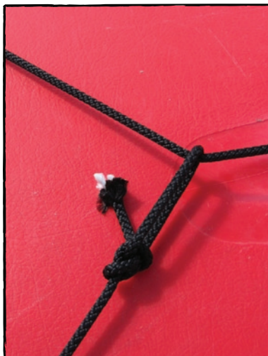
Photo 33, Form a triangle