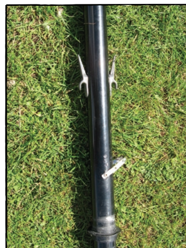
Photo 7, Mast Cleats