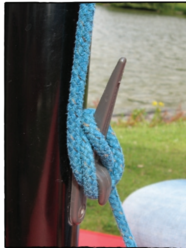
Photo 24, Cleat it off