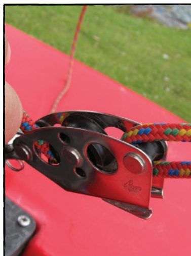
Photo 26, Attach the jammer