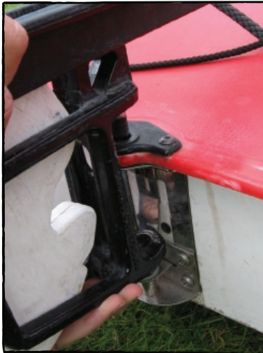
Photo 39, Attach the rudder

Attach the rudder - click the rudder onto its pins on the back of the boat (Pictures 40 and 41), and feed the tiller and extension underneath the main length of the horse with the main-sheet block attached, and over the other part of the horse as shown. Pull and raise the tiller extension to raise the rudder block and lock it in the up position.