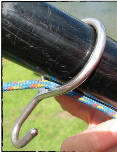
Photo 19, Clew hook

Pass the rope along, through the metal S-hook that acts as the clew tie down (once again, we have the hook upside down (Photo 19), underneath the boom, whereas when its' hooked into the sail it will be above the boom. The rope carries on through the jammer; tie a stopper or figure eight knot and secure (Photo 20).