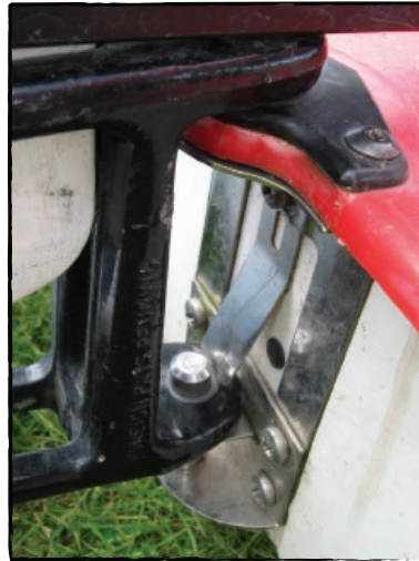
Photo 40, Clip it on