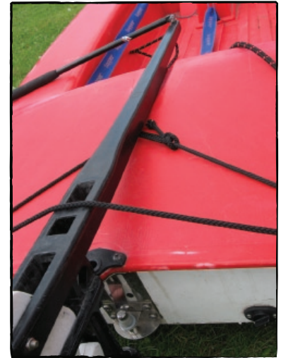
Photo 41, Under the horse