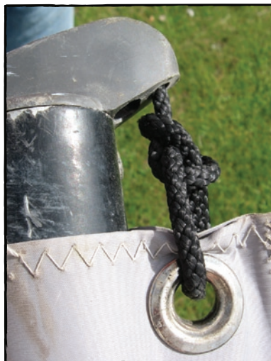
Photo 11, Attach the sail

Make sure the loop on the bottom edge of the sail is in line with the one cleat and kicking strap metal loop at the bottom of the mast (Photo 7). Cleat the bottom end of the halyard around the clam cleat it's in line with (Photo 12).