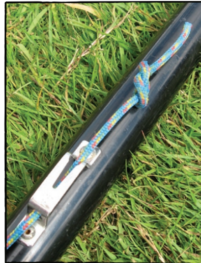
Photo 20, Through the jammer