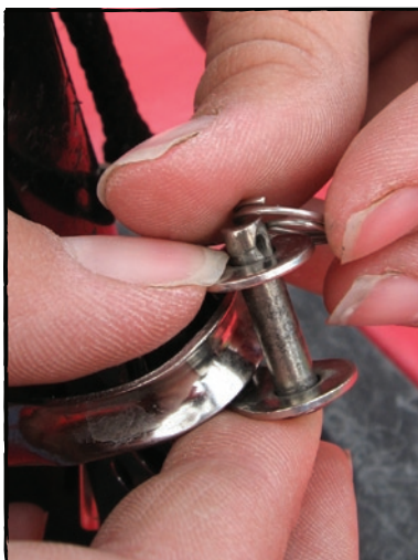
Photo 25, Attach to the mast

Assemble the kicking block as shown, and clip the kicker jammer block onto the mast using the metal loop shown in Photos 25 and 26, and click the s-hook to the fitting on the underside of the boom, as shown in Photo 27.