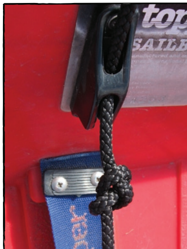
Photo 34, Through the cleat