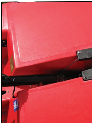
Photo 13, Guiding the mast