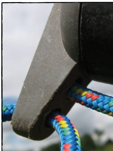
Photo 17, Back through