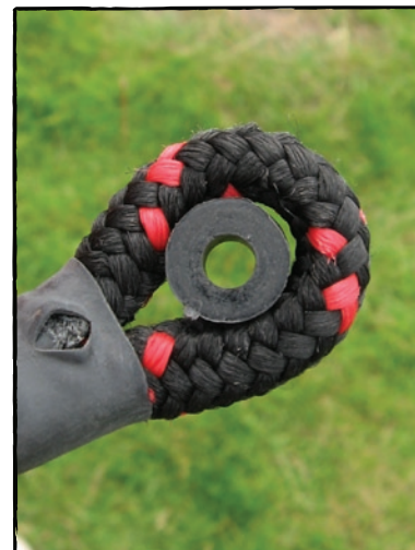
Photo 35, The main sheet end