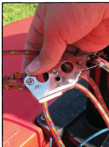
Photo 29, Through the jammer