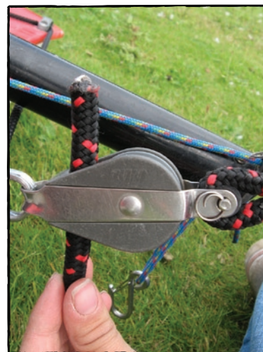
Photo 38, Back through first block

Feed it up through the top block, which should be a swivel block attached to a hole on the underside of the boom end using a pin (Photo 37), then back down through the lower block (Photo 38), and drop it into the cockpit. Tie a stopper knot in the end as required to stop it all feeding back through.