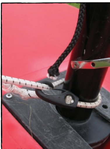
Photo 42, Secure the daggerboard

Using shock cord/bungee cord and a clip, attach the daggerboard to the mast (Picture 43) to stop it falling off in the event of you going for a swim.