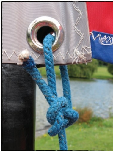
Photo 23, The cunningham

Using a metal s-hook, shackle or bowline, attach the downhaul or Cunningham to the metal ring in the bottom of the sail by its leech (where it meets the mast, Photo 23), and use a cleat on the mast to secure the rope at the required tension (Photo 24).