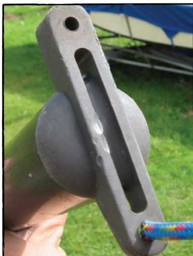
Photo 16, Starting the outhaul

Make sure you have the boom the right way up for this step; the metal fixing near the mast end should be on the underneath, since it's for the kicking strap to attach to. Pass one end of the outhaul rope through the highest hole on the TOP of the end of the boom (note that we rather not so helpfully had our boom upside down, Photo 16). In the picture you should just about be able to make out two holes - go through the outermost one first.