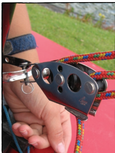
Photo 28, Around the block

Using a metal s-hook, shackle or bowline, attach the downhaul or Cunningham to the metal ring in the bottom of the sail by its leech (where it meets the mast, Photo 23), and use a cleat on the mast to secure the rope at the required tension (Photo 24).