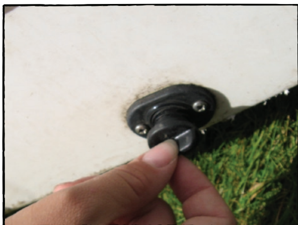
Photo 3, Insert the Bung