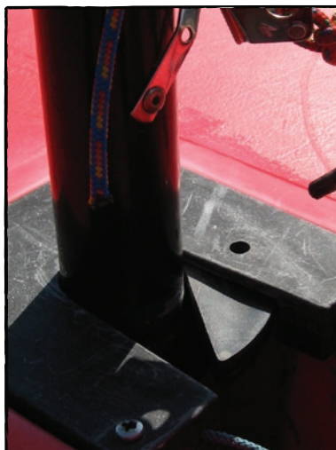
Photo 14, Securing the mast