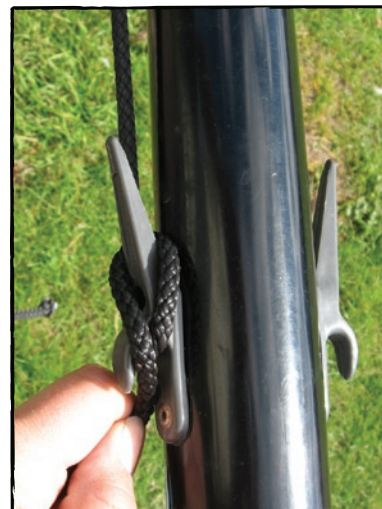
Photo 12, Cleat the halyard