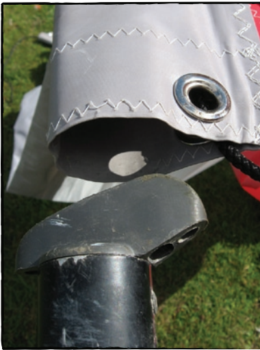
Photo 8, Inserting the mast