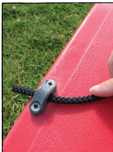
Photo 31, Through the eye