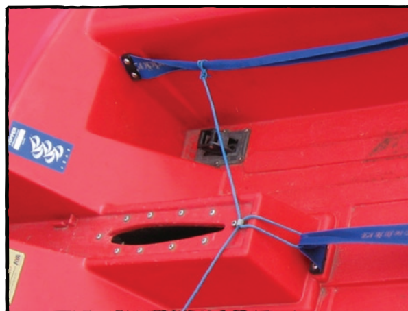
Photo 4, Check the self bailer