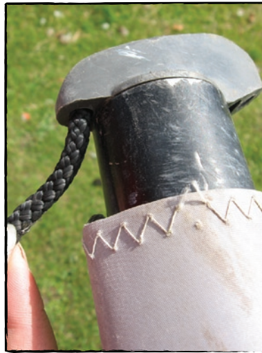
Photo 9, Through the top