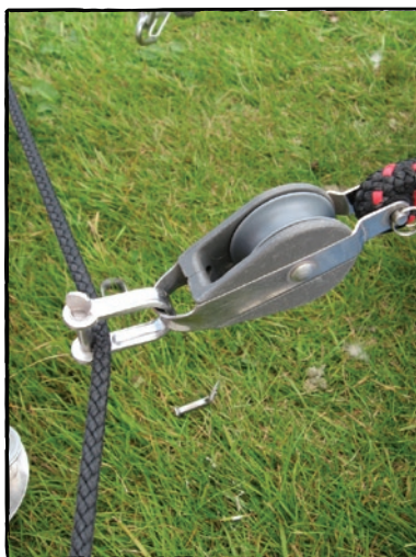
Photo 36, First block

Attach one mainsheet block to the underside of the end of the boom, and the other (the one with the becket) is attached to the horse between the two eye holes (Photo 36). Attach the mainsheet around the becket on the lower block.