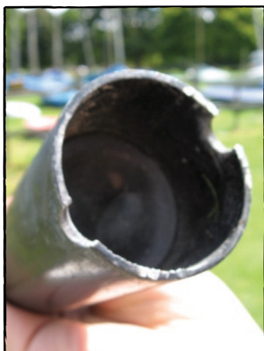
Photo 5, Mast Notches

Put the mast halves together (aligning the small pins in the lower half of the mast (Photo 6) with the slot in the upper half (Photo 5), they won't come apart when the sail is fitted over the mast, the sail and gravity will hold them together when it is pulled on.